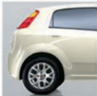
Bossa Nova White