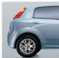
Fox Trot Azure