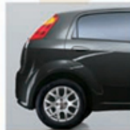
Hip Hop Black